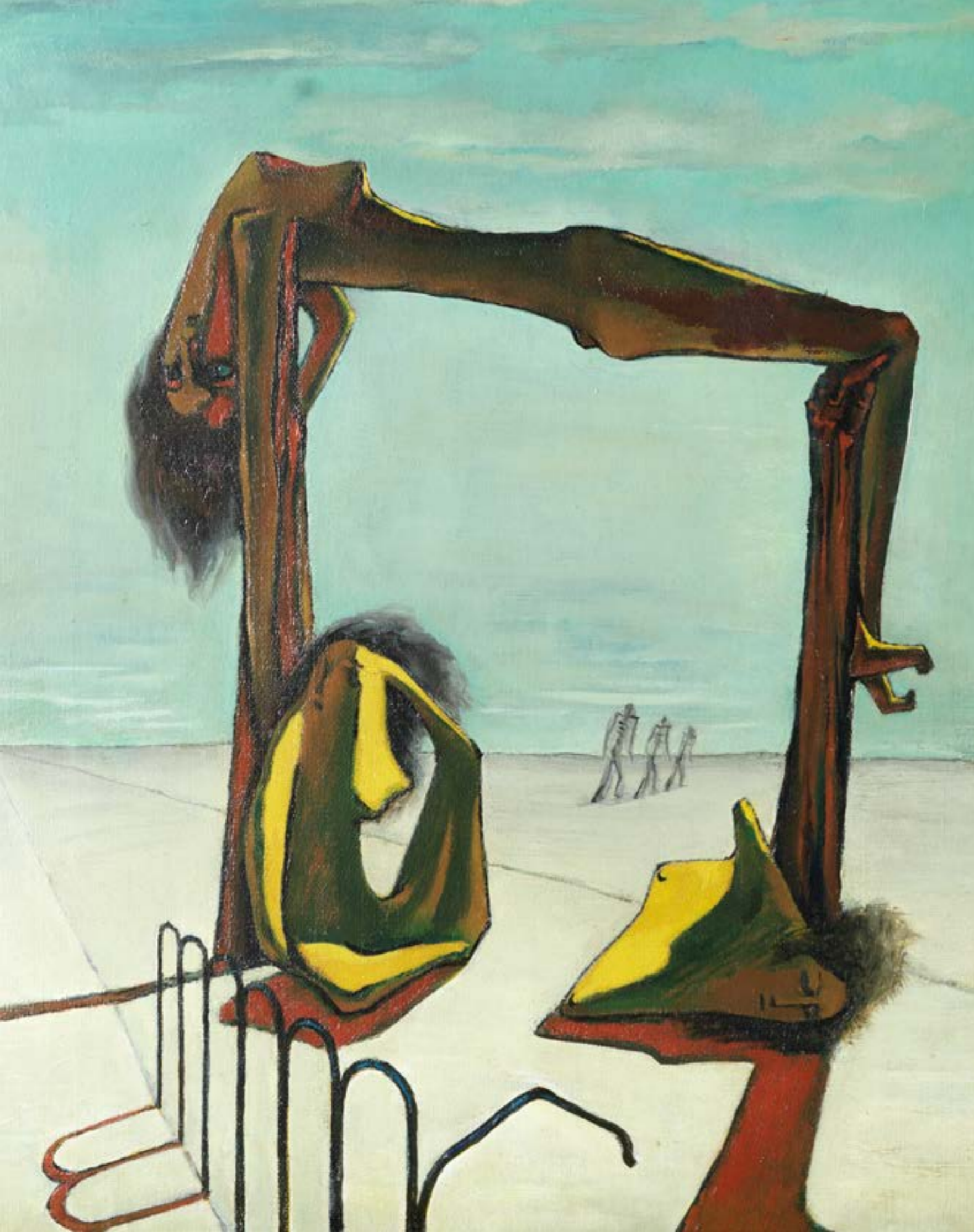
Facing page: Ramses Younane, Untitled , 1939. Oil on canvas, 46.5 x 35.5 cm.