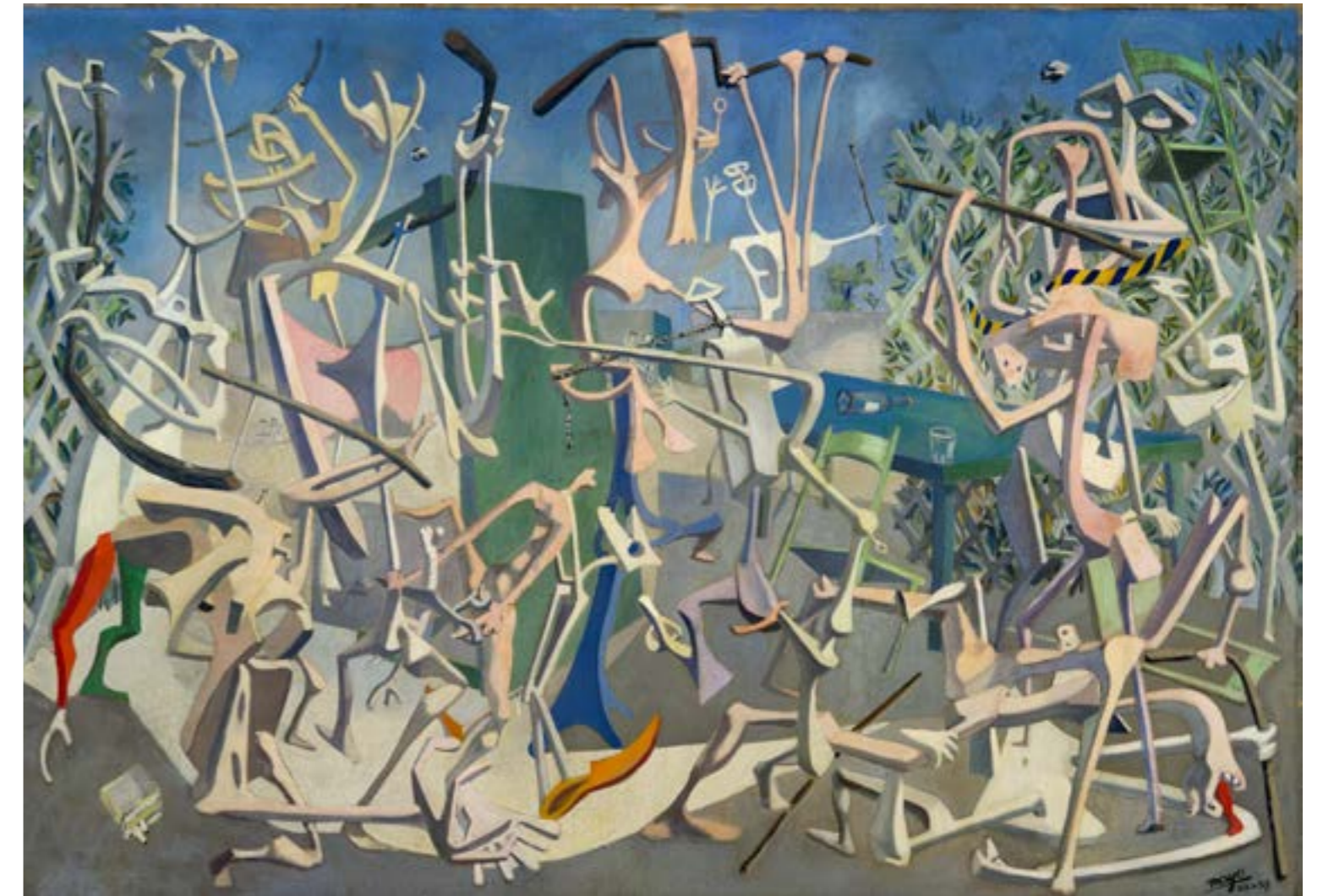
This page: Mayo, Coups de Bâtons, 1937. Oil on canvas, 167 x 243 cm. Private collection.

establishment and, like any other group deemed “subversive”, subject to state-organised physical violence. Mayo’s Coups de bâtons (1937) was inspired by a police baton charge on a café frequented by artists and intellectuals. Discord and vitriol from outside was mirrored to some extent by outbreaks of dissent and agreement within the group, which saw some artists dissociating themselves from Surrealism and breaking away from Art and Liberty to form the Contemporary Art Group, dedicated to the development of what they saw as a truly authentic Egyptian art. This group included artists who were to become seminal figures in Egyptian Modern art, such as Abdel Hadi El Gazzar, Hamed Nada and Samir Rafi.