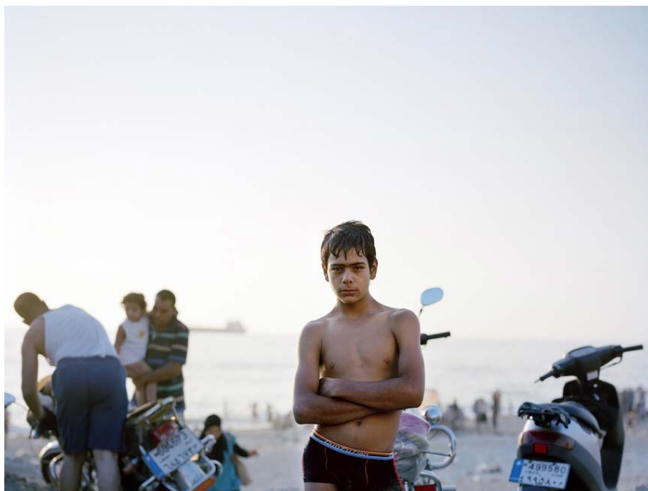
George Awde, His Passing Cover , 2014, Digital print, 30 x 37 cm

11 Jul — 22 Aug 2015 at The Mosaic Rooms in London, United Kingdom